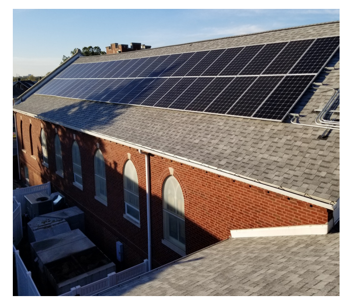
Christ United Church of Christ Dupo, Illinois

The Genesis Worship Center was able to build 12 units of transitional housing for formerly incarcerated men.