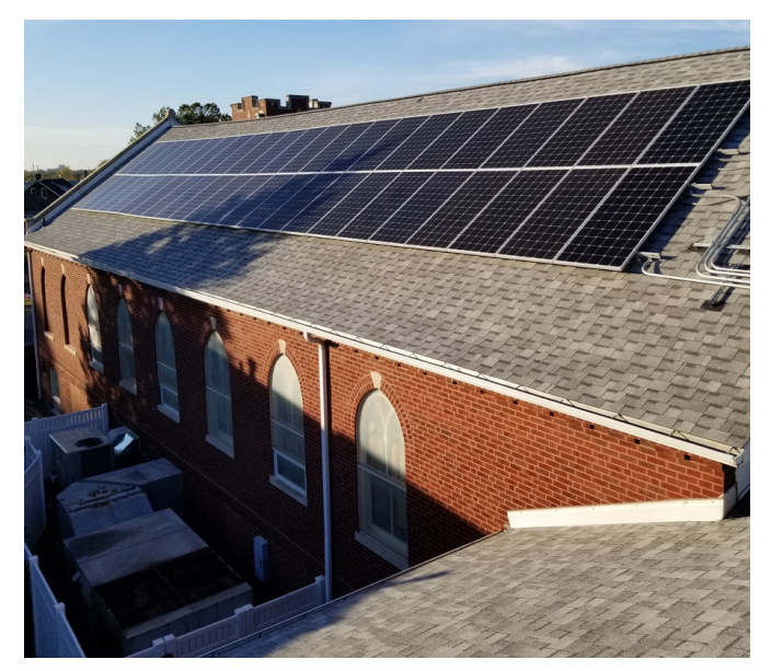
Christ United Church of Christ Dupo, Illinois

The Genesis Worship Center was able to build 12 units of transitional housing for formerly incarcerated men.