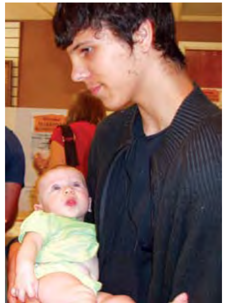
In class and out, our entire community participates in Christian education.