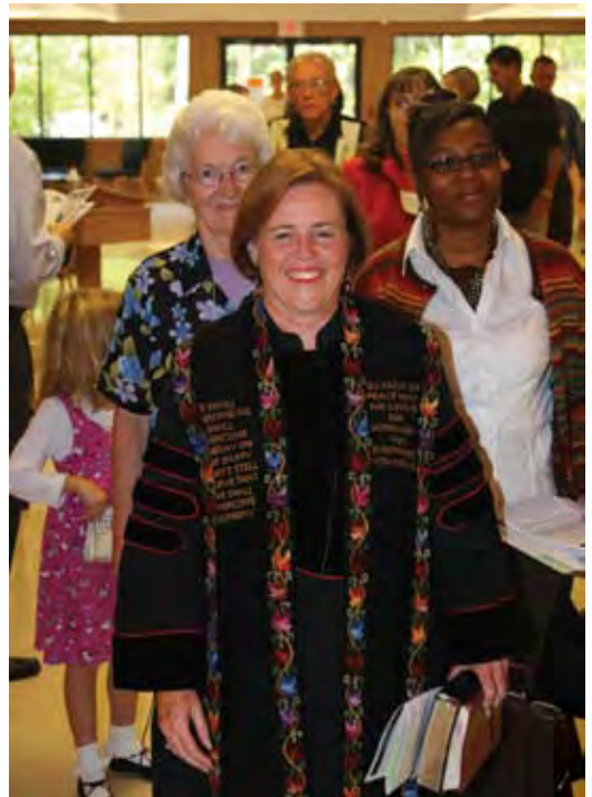
Holy Covenant celebrates the participation of every member in our life and worship.