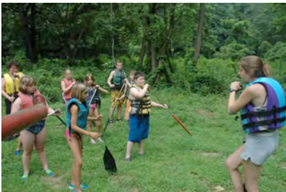
John's River Valley Camp

Additionally, support to the Local Benevolence Fund helps meet the needs of persons in the community who fall outside the work of OCIM. In addition to the funds designated in the budget, we support missions through fund raising activities. Some of the missions we supported this past year were the Resettlement of a Burmese family, The